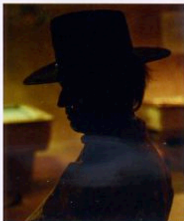
Reportage 2. New Orleans to New Mexico P223–238