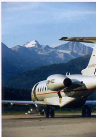
Destinations. Alpine airports , P045–053

The kimono-clad mayor of Kyoto, the scion of a boating dynasty, a head honcho from Hyatt and the woman gambling on changing Las Vegas for the better – and that's just for starters.