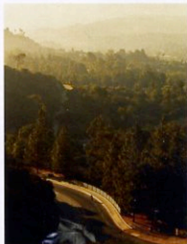
Travel. Cities at dawn , P127—133