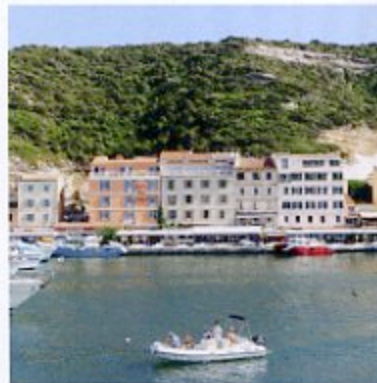
Destinations. Corsica , P037—043

Graphic novels, cameras, picture books and chargers – they're all here. Make some room in your carry-on.