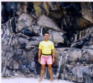
Destinations. Madeira , P113–122

Cairo's Zamalek is an unlikely oasis on the Nile that is bursting with lush parks and new hotels. Is this Egypt's most liveable 'hood? Pay a visit with us and see for yourself.